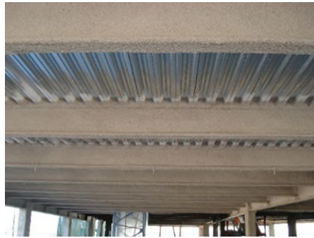
Figure 2. Visual representation of Isolatek CAFCO® 300 series