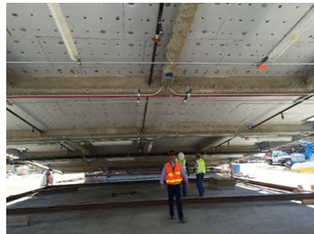
Figure 5. Visual representation of Isolatek BLAZE-SHIELD® series