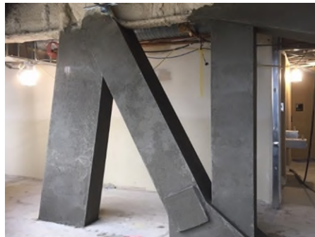
Figure 4. Visual representation of Isolatek FENDOLITE® series