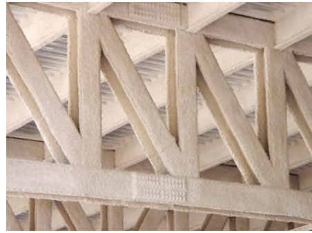
Figure 3. Visual representation of Isolatek CAFCO® 400 series